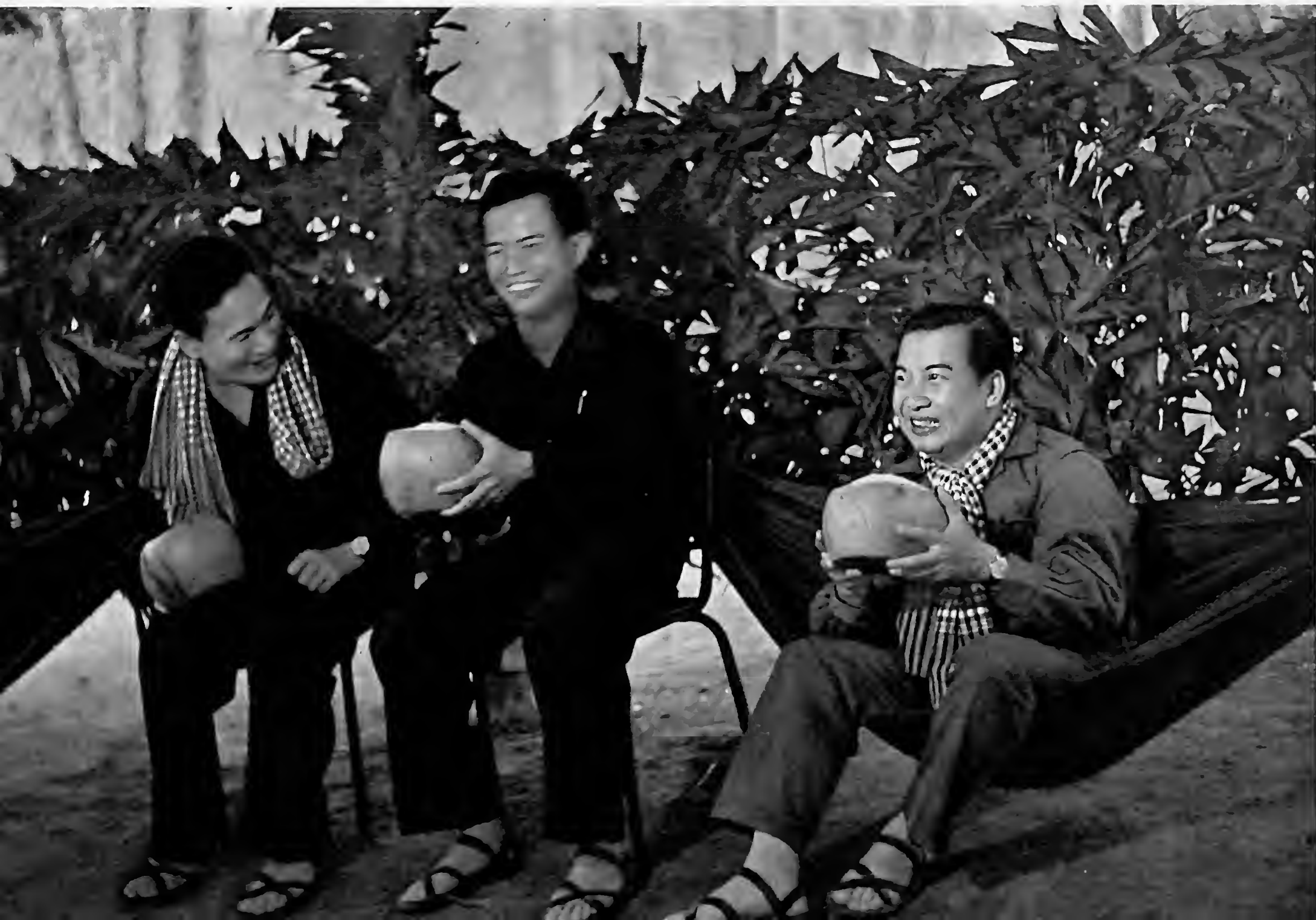
Samdech Sihanouk, Mr. Khieu Samphan and Mr. Hu Nim drinking coconut milk.